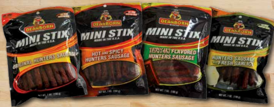
6051 - MILD MINI STIX 6052 - HOT MINI STIX 6053 - TERIYAKI MINI STIX 6054 - GARLIC MINI STIX