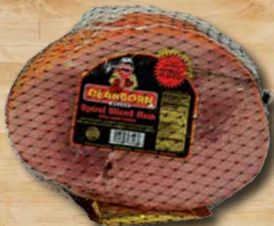
6002 - HALF SPIRAL SLICED HAM WITH GLAZE PACKET ON SIDE