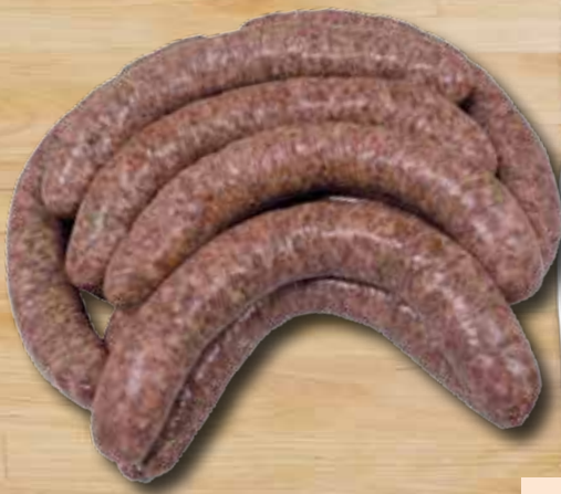
6023 - FRESH KIELBASA