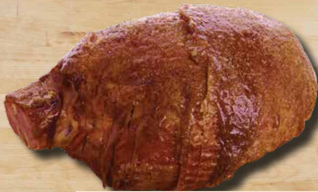
6005 - WHOLE SPIRAL SLICED TORCHED GLAZED HAM