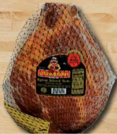
6001 - WHOLE SPIRAL SLICED HAM WITH GLAZE PACKET ON SIDE