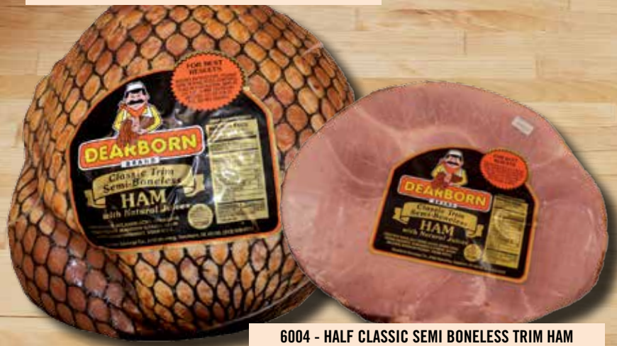
6004 - HALF CLASSIC SEMI BONELESS TRIM HAM