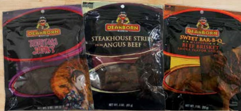
6056 - TERIYAKI JERKY 6057 - STEAKHOUSE STRIPS 6058 - SWEET BBQ BEEF BRISKET