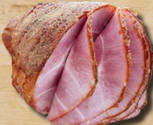
6006 - HALF SPIRAL SLICED TORCHED GLAZED HAM