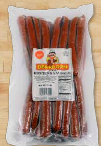
6026 - HUNTERS SAUSAGE - HOT

For more information call or e-mail us at (313) 842-2375 ext.3042 or bstout@dearbornbrand.com