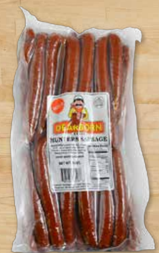
6027 - HUNTERS SAUSAGE - MILD

6058 - Sweet Bar-B-Q Beef Brisket – 3oz packages/sold in case only – 8 pks to a case