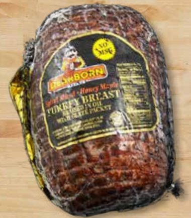
6019 - SPIRAL SLICED TURKEY BREAST